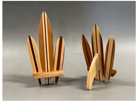
Surfboard Phone Stands